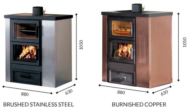
CALDEA BASE IDRO